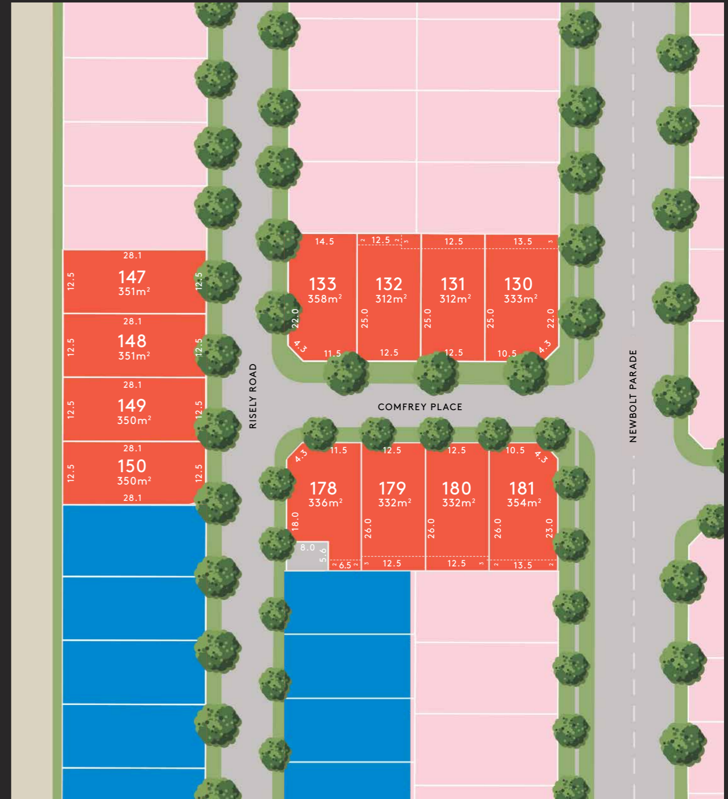
Artist impression only. Not to scale.